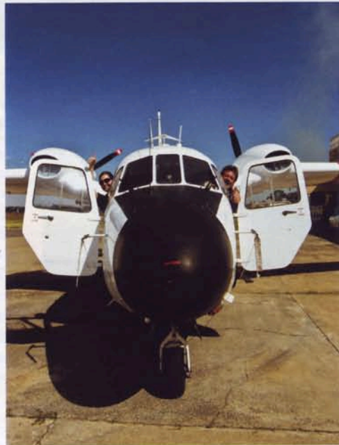
TOP: Heart of gold: the city of Johannesburg, now 125 years old, covers an area slightly larger than Greater London. With a population of about 3,3 million, it ranks among the world's largest 100 cities. The modern stadium in the foreground is the Johannesburg Athletics Stadium in the suburb of Doornfontein. Able to accommodate 37 500 people, it was originally built as an athletics stadium, but has also rugby matches and music concerts. ABOVE RIGHT: Up, up and away: at one time Sky Africa's Piaggio Albatross was used by the South African Air Force to patrol the coast. These days the executive cabin craft is used for air safaris. It has comfy seating and there's room to move around for better views. The large windows allow for excellent views and photo opportunities.

Aside from being highly entertaining, the pilots were excellent guides, pointing out areas of interest and doing their utmost to offer the best photographic angles on popular sites. It's a great way to explore the area regardless of whether you're a long-time resident, tourist or business visitor. Rates are R940 a person for the Gold Reef Tour, R1 400 for the Golden City Flight and R2 400 for the Flight of Two Cities. (Prices based on booking the full aircraft, otherwise on request. Sky Africa does pick-ups). Sky Africa also offers tailored air safaris across Africa. Cell 082-563-3314 or 071-607-7109, email reservations@skyafrica.com , www.skyafrica.com .