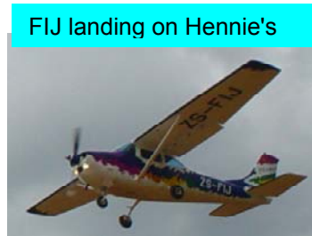
FIJ landing on Hennie's