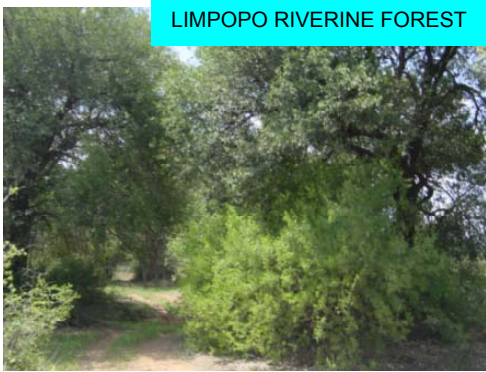
LIMPOPO RIVERINE FOREST